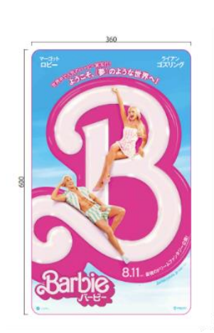
H 600mm x W 360mm