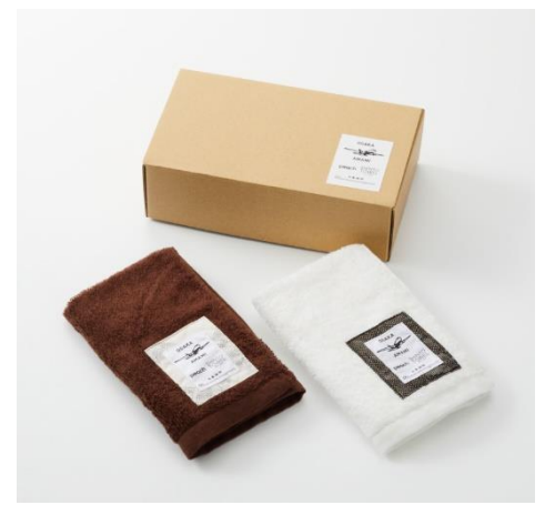
Peach × SHINTO TOWEL × Oshima Tsumugi (Pongee) Hand Towel Set ¥2,420