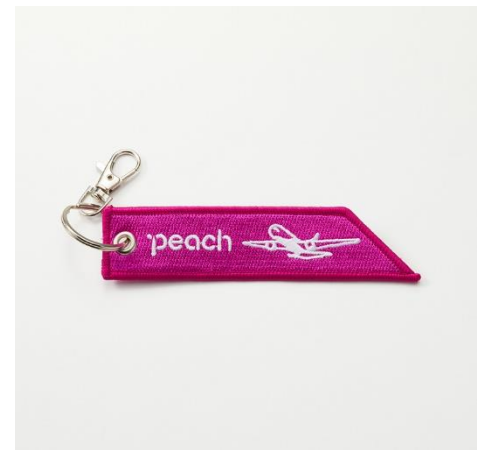
Peach Original Embroidered Flight Tag ¥880