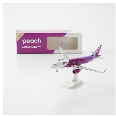
[Peach Original] 1:200 A320neo Scale Model ¥7,150