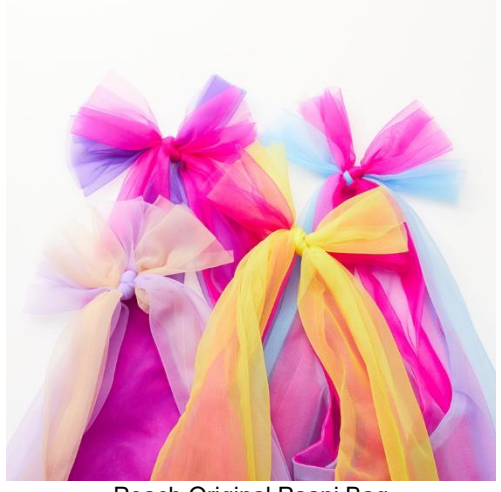
Peach Original Paani Bag ¥2,970