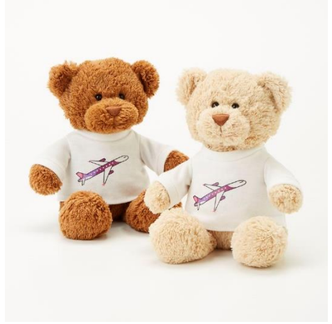
[Peach Original] GUND T-shirt Bear, Brown ¥2,200 (each)