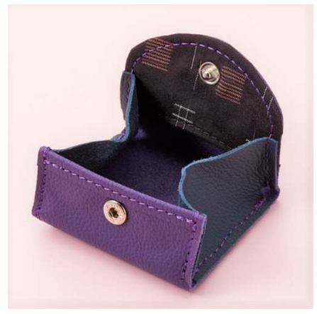
Peach x Oshima Tsumugi coin case ¥3.520

< Peach and Oshima Tsumugi collaborative products > *All prices include tax, only 30 of each available.