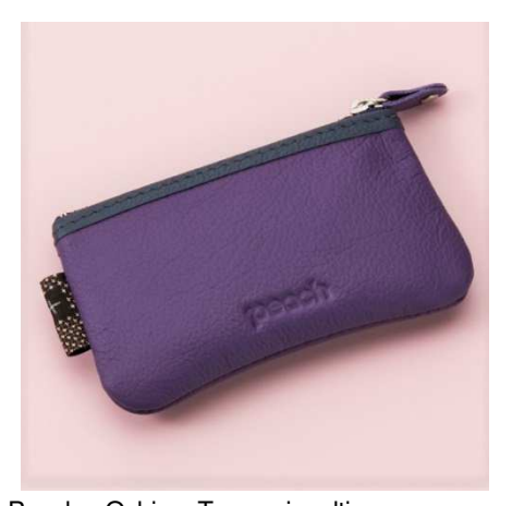
Peach x Oshima Tsumugi multi-purpose case ¥3.850

Please see the "Amami Service Commemorative Collaboration" page on the "PEACH SHOP ONLINE" website for details.