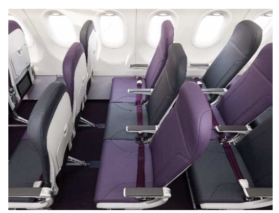
Original goods using seat cover cutoffs Peach aircraft seat

Osaka December 24, 2019 - Peach Aviation Limited (hereinafter, Peach; President & CEO: Shinichi Inoue) today announces the release of their original goods made from the remainders of seat covers that are only available via Peach's online outlet: "PEACH SHOP ONLINE" (https://shop.flypeach.com).