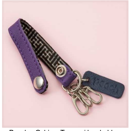
Peach x Oshima Tsumugi key holder ¥3,300