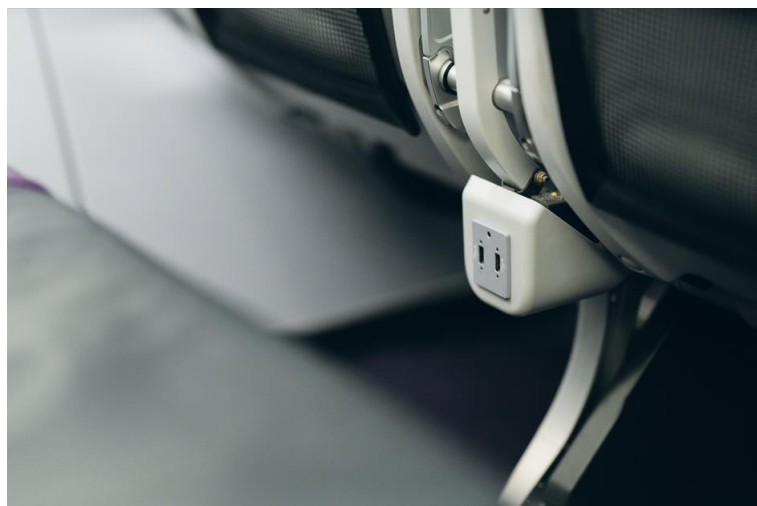
USB terminal for charging of electronic devices