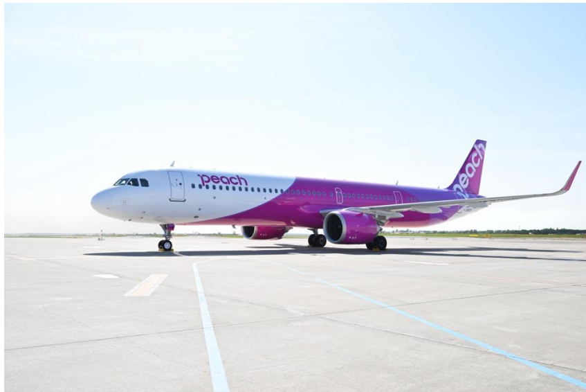
A321LR (Introduced on December 28, 2021)

SINGAPORE, August 29, 2024 - Peach Aviation Ltd. (hereinafter: Peach, CEO: Kazunari Ohashi) announced the launch of its new daily Singapore - Osaka (Kansai) flights from Changi Airport, commencing 5 December. Flight tickets go on sale today.