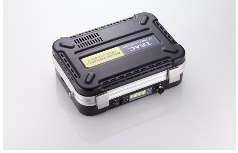
In-flight server on board

Japanese Unexamined Patent Application No.: 2020-181534 Title of invention: Payment method, program, information processing system and payment system Publication date: Nov.5 2020